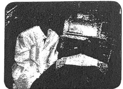
Discussing post-op instructions

To control discomfort , take pain medication before the anesthetic has worn off or as recommended.